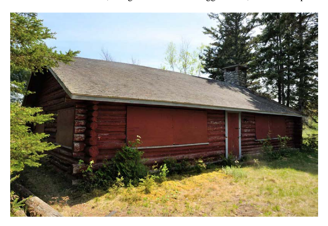
The now shuttered Dennys River Sportsman's Club

At the time, USFWS was undertaking a review of Atlantic salmon recovery efforts. One of the issues was to determine whether the Penobscot and Kennebec Rivers should be added to the recovery zone, or Distinct Population Segment (DPS). Not only did they force Maine to suspend the experimental fishing season due to too many fish being caught, they eventually added the Penobscot and Kennebec, along with the Androscoggin River, to the list of protected waters.