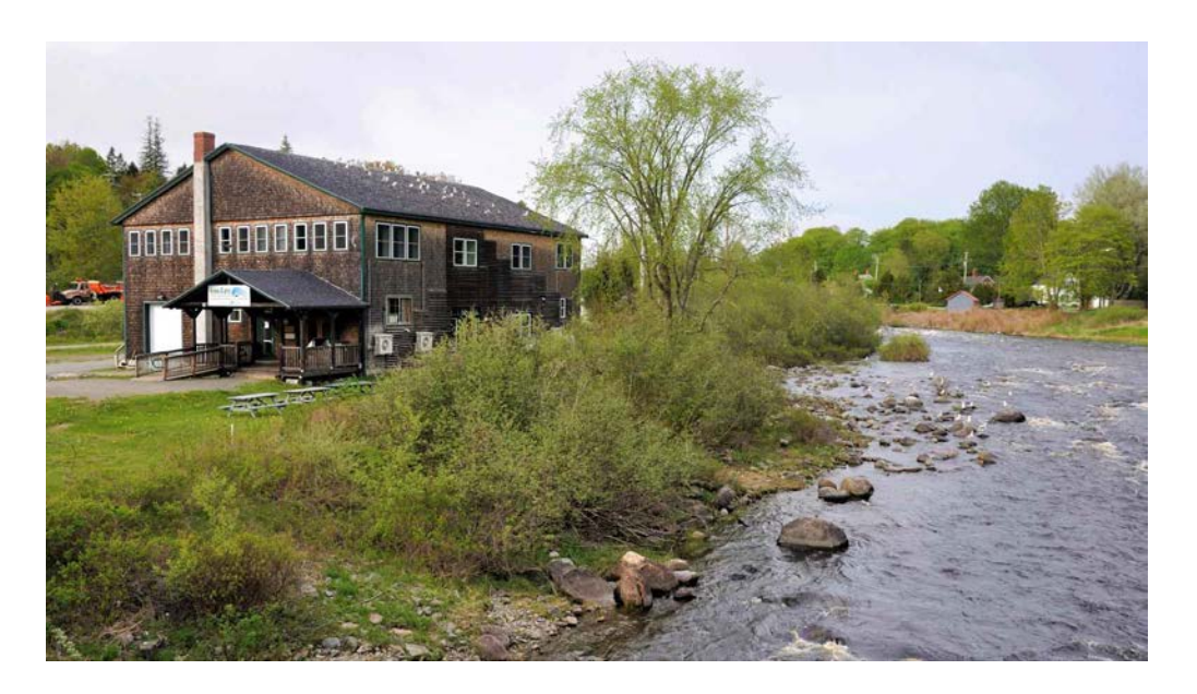
DSF's Peter Gray Hatchery on the banks of the East Machias River